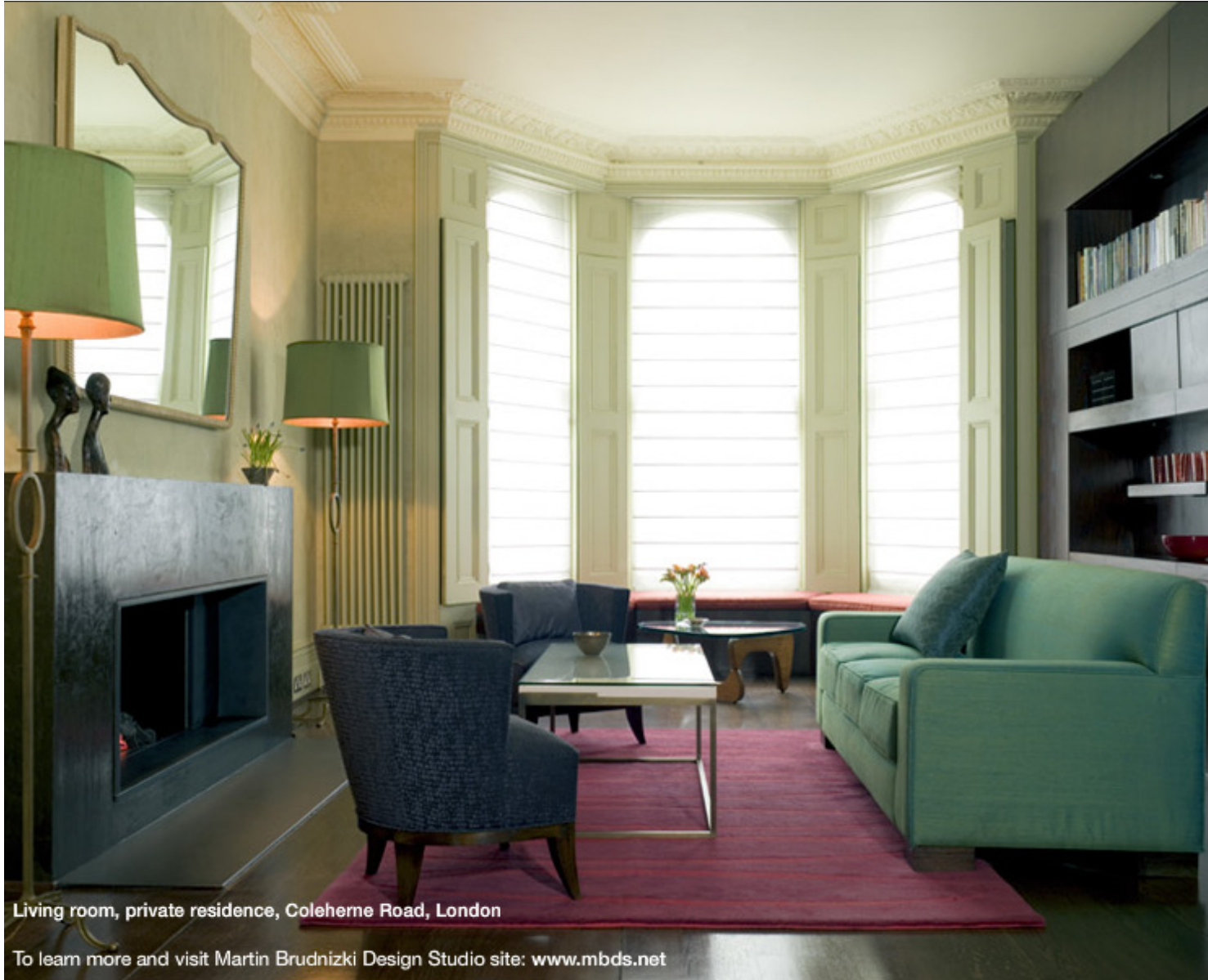
Living room, private residence, Coleheme Road, London

To learn more and visit Martin Brudnizki Design Studio site: www.mbds.net