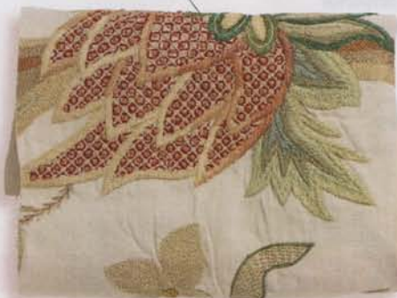
FLOWER & FERN (IN COLOR 01); LINEN, COTTON

BEST FOR: Bed skirt "I find with bed skirts, people tend to put their shoes against them, so they get marks. You want something that can be easily cleaned." OSBORNE & LITTLE : 212-751-3333.