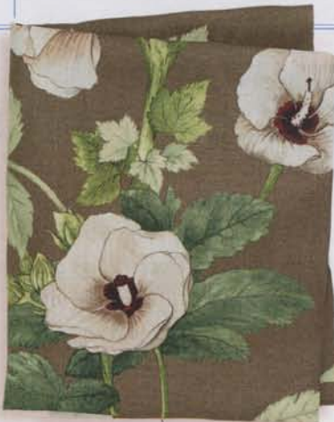
ECOUTE DANS LE VENT (IN COLOR 88); LINEN

BEST FOR: Chair "Really glamorous. I don't like lots and lots of sheeny, shiny fabric, but a little something adds a beautiful touch." CRÉATIONS MÉTAPHORES THROUGH JERRY PAIR : 212-546-9001.