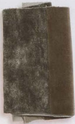
BEL AMI (IN ETAIN); COTTON, VISCOSE