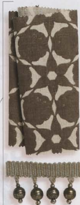
FLOWER CUT OUT 3 (IN BROWN/NATURAL); LINEN

BEST FOR: Headboard "It's a botanical print that looks as if someone's drawn it by hand on a taupe background. On a headboard, it's like having another picture on the wall." NOBILIS : 800-464-6670.