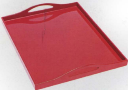
BRIGHT AND SHINY Estate lacquer tray, $135; from Lauren Home: 888-475-7674.