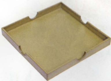
LEATHER BAR Square leather tray with steel stud accents, $95; from Apartment 48: 212-807-1391.