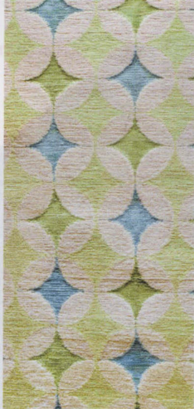
FOUR LEAF CLOVER